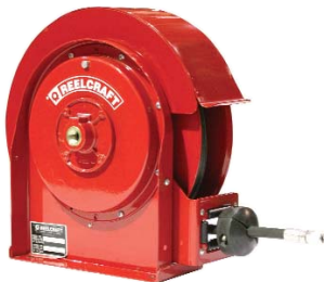
Model Shown: AV4425 OLPBWL