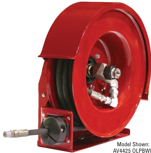
Model Shown: AV4425 OLPBWR