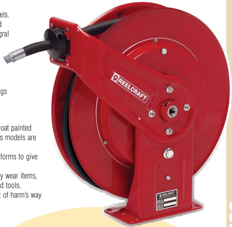
model shown: UR7925 OLB

Reelcraft offers a complete line of over 2,500 hose, cord and cable reels. For more information visit us on the web at www.reelcraft.com .